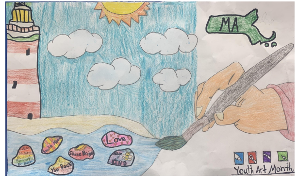
Victoria Moura - Grade 5